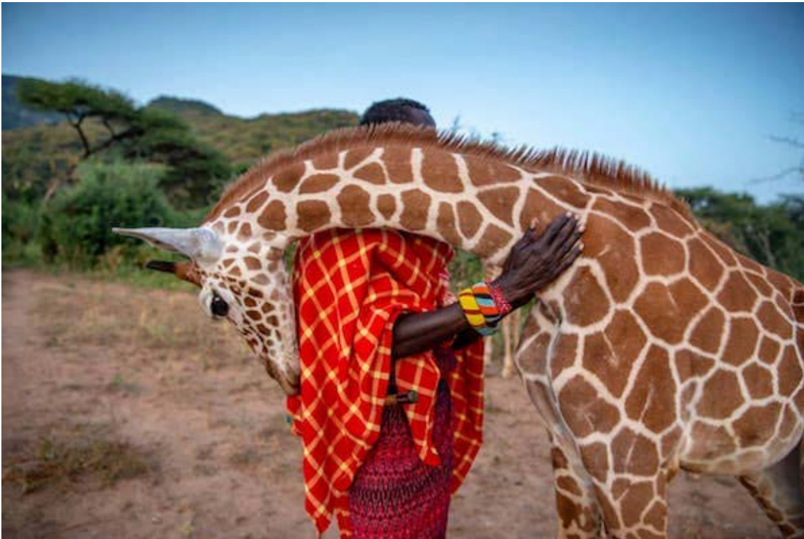
Orphan reticulated giraffe with wildlife keeper

Our civilization is failing. Nature is being brutally killed. We aren't going to have a nice future in the old, narcissistic, consumerist sense. We can have a much better future than that ever was. But we've got to get our hearts ready, and our minds, and our families and friendship networks. Wholly new careers are now needed and wide open and we've got to support people in them -- support them with intellectual, moral, material, and social resources, as we step into evolving new roles ourselves.