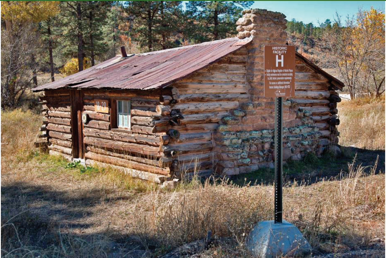
Pond Cabin, built in 1914, is listed on the New Mexico State Register of Historic Places and is the only surviving log structure at the Laboratory dating to the Homestead period.