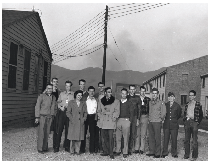
Technical Area-18 (aka the Pajarito Site—home to Pond Cabin, the Slotin Building, and Battleship Bunker) will likely be the first area accessible to the public. During the Manhattan Project, Italian physicist and Nobel Laureate Emilio Segrè (far left, with his group) used Pond Cabin for plutonium chemistry research.