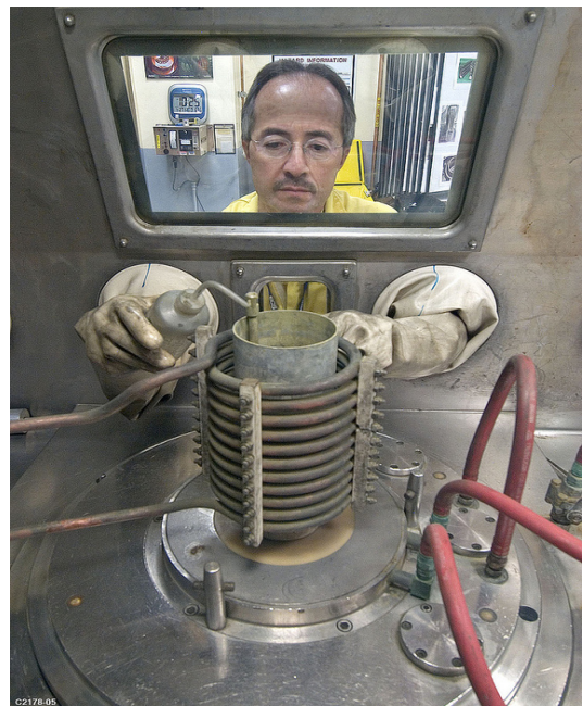
Manufacturing Operations at PF-4

On July 15, 2013, the Board issued a letter and report to the Secretary of Energy to assist NNSA in improving criticality safety and conduct of operations at Los Alamos. The Board's letter requested that NNSA provide a report and briefing on root causes and planned corrective actions, including actions to improve federal oversight of criticality safety and conduct of operations.