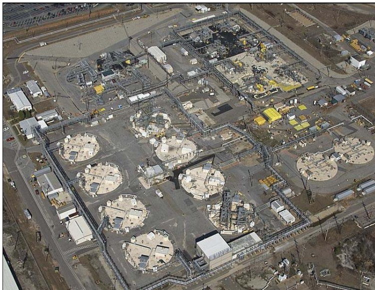
Aerial View of F-Tank Farm, Savannah River Site

Stabilization and final disposition of the remnants of nuclear weapons production are essential tasks to protect the public. DOE stores more than 50 million gallons of high-level radioactive waste in 177 underground tanks at the Hanford Site. Many of the old single-shell tanks have been known to leak. As a result, DOE transferred most of the liquid waste in those tanks to newer double-shell tanks. The Board has been following DOE's plans for leaking tanks and the impact these tanks have on DOE's overall waste retrieval, treatment, and disposition strategy. In August 2012, DOE discovered that waste in double-shell tank AY-102 was leaking into the tank's secondary containment. This situation reinforces the need to retrieve and treat the tank waste and for vigilance in maintenance and safe operations in the Hanford Tank Farms for the foreseeable future, including maintaining ventilation as a safety-significant system to