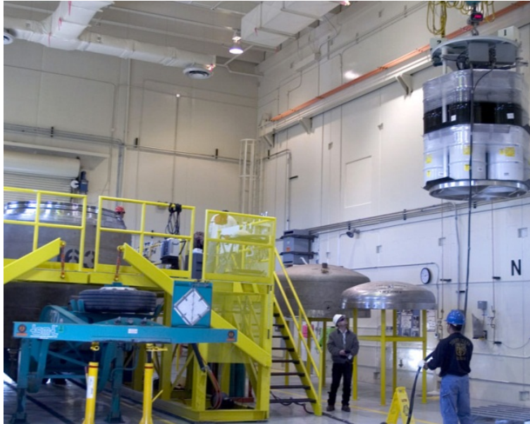
Transuranic Waste Operations at Radioassay and Nondestructive Testing Facility, Los Alamos National Laboratory

Members of the Board's staff also performed conduct of operations assessments at Los Alamos National Laboratory's transuranic waste operations and the Nevada National Security Site. The Board's staff identified weaknesses in the implementation of numerous elements of DOE Order 422.1, Conduct of Operations . The Board's staff provided feedback and suggestions for program improvement to site personnel. Members of the Board's staff continue to monitor the safe implementation and effectiveness of the operations and maintenance programs.