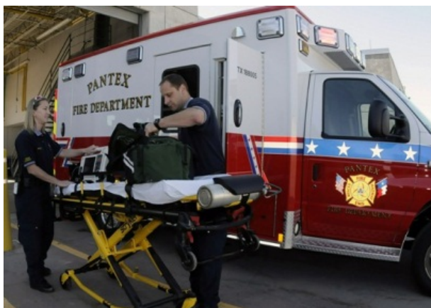
Emergency Services, Pantex Plant

At the Board’s public hearing in Amarillo, Texas, held on March 14, 2013, the Board questioned a panel of NNSA and contractor witnesses about the Pantex Plant’s preparedness for responding to severe operational or natural phenomena events. The discussion covered the types of severe events that Pantex has identified and analyzed, as well as the scope of emergency drills and exercises. As part of their response to Board questions, contractor personnel committed to conducting an exercise that would assess the termination and recovery phases of emergency response. The Board also examined the effectiveness of drills and exercises conducted at Pantex and the evaluation and implementation of corrective actions