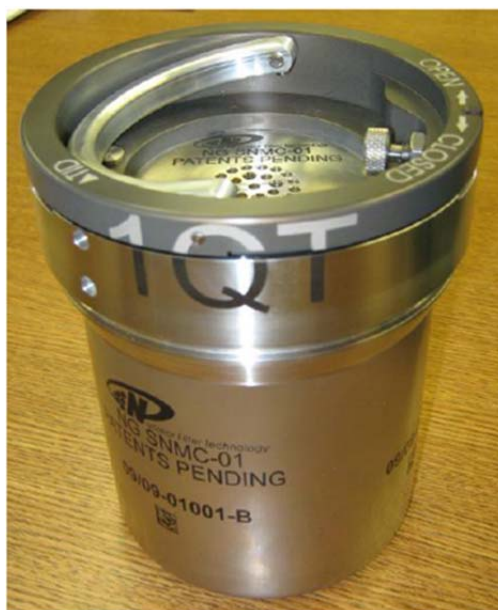
New Plutonium Storage Container

DOE personnel have been developing an update to the September 2009 DOE-wide plan and schedule for implementing the Manual.