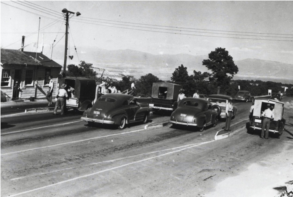
Los Alamos Main Gate, Manhattan Project