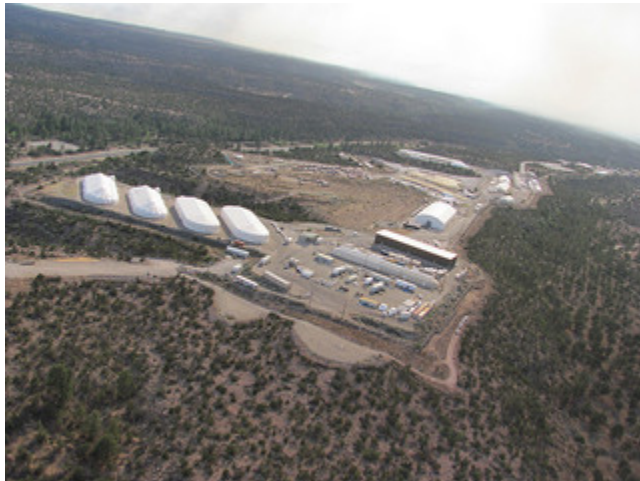
Aerial View of Area G, Los Alamos National Laboratory

Members of the Board’s staff observed the contractor’s readiness assessment and conduct of operations for waste sorting, size reduction, and repackaging operations in Dome 375 of Area G. The staff team identified deficiencies in supervisory oversight and