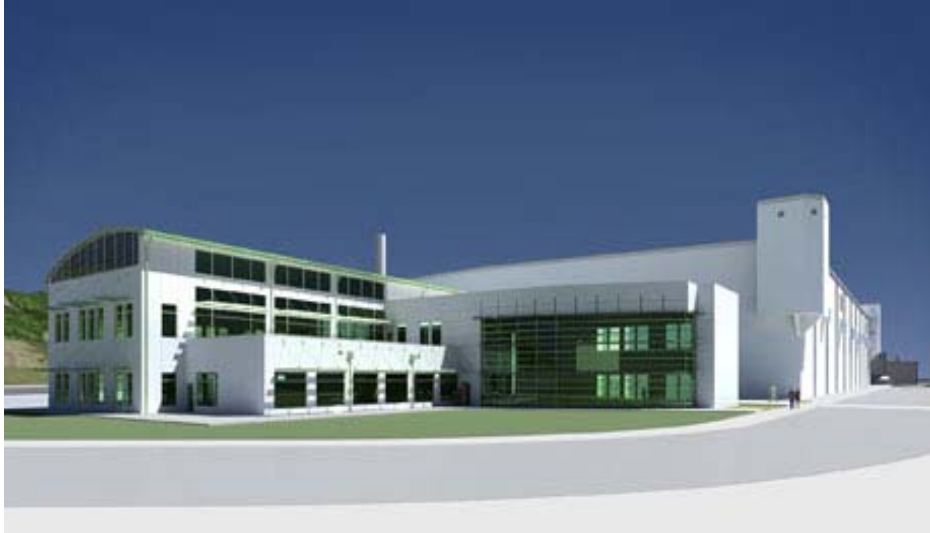
Artist's Rendering of the Uranium Processing Facility

integrated safety into the preliminary design. NNSA independently identified many similar issues during its review of the preliminary safety analysis. The project team revised the preliminary safety analysis and design documentation to address these issues. In 2013, the Board reviewed the revised documentation and concluded that while NNSA had made progress in resolving the safety issues identified in the April 2012 letter, new safety issues concerning the effectiveness of safety controls required additional action by NNSA to ensure the integration of safety into the design. In an August 26, 2013, letter to NNSA, the Board requested that NNSA provide a plan and schedule for addressing these new safety issues. NNSA briefed the Board on its plans on November 21, 2013. The Board is reviewing these plans.