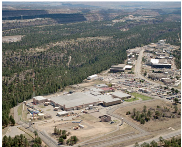
Plutonium Facility (PF-4, in foreground)

On October 26, 2009, the Board issued Recommendation 2009-2, Los Alamos National Laboratory Plutonium Facility Seismic Safety , to focus the attention of DOE and NNSA leadership on the need to address the danger posed by an earthquake and subsequent fire at PF-4. In response, the laboratory undertook a series of actions to improve the safety posture of this facility. These actions included efforts to strengthen the structure of the building and to reduce the likelihood and severity of a post-seismic fire.