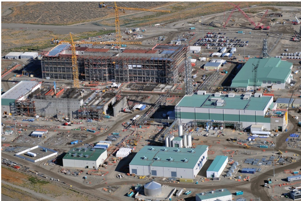
Waste Treatment and Immobilization Plant, Hanford Site

Additional information on these safety issues can be found in the Board's reports to Congress dated July 15, 2013, and December 26, 2013, available on the Board's website.