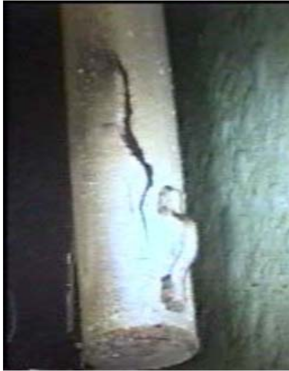
Degraded Fuel Can, Savannah River Site

HB-Line Facility. The Board's staff reviewed the documented safety analysis for HB-Line and identified potential safety vulnerabilities in the facility contractor's proposal to downgrade the classification of the diesel generator from safety-significant to general service. If normal power were lost and the generator failed to start, then both the normal purge air system and the emergency alternate purge method would become inoperable, along with the room and glovebox exhaust systems. In such a scenario, there would be no controls to prevent the accumulation of flammable gas in the tanks and dissolvers. DOE subsequently directed the contractor to maintain and operate the HB-Line diesel generator and vessel vent system piping as safety-significant systems and to formally upgrade them to safety-significant within six months. DOE also took action to revise calculations of flammable gas accumulation rates in the safety analysis to correct an error identified by the Board's staff. This resulted in changes to the Technical Safety Requirements to ensure that a loss of purge air flow would be corrected before flammable conditions could develop in a process vessel.