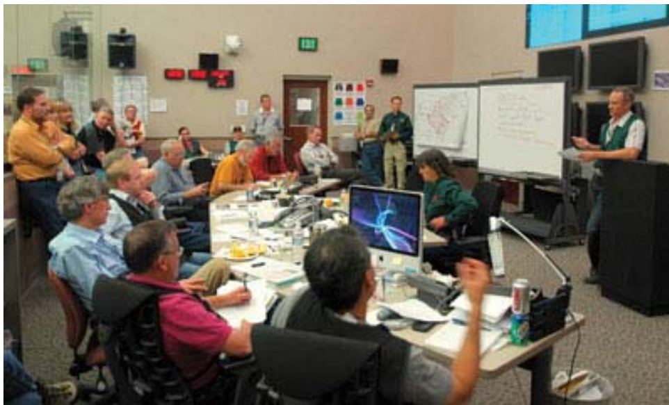
Emergency Operations Center, Los Alamos National Laboratory

Throughout the year, the Board's site representatives and other members of the Board's staff conducted reviews to improve emergency preparedness and response capabilities at DOE sites. These reviews included observations of exercises and drills at various DOE sites, as well as programmatic reviews of emergency preparedness and response programs at DOE sites. The scope of these programmatic reviews was not limited to a site's preparation for severe events, but extended to the site's overall emergency preparedness and response program and associated facilities and equipment. The Board's staff also provided input directly to DOE's staff assigned to regulate emergency preparedness and response at DOE sites. This input included feedback on proposed DOE guidance on severe events and observation of independent assessments conducted by DOE's Office of Health, Safety and Security at Lawrence Livermore National Laboratory, the Hanford Site, and the Nevada National Security Site.