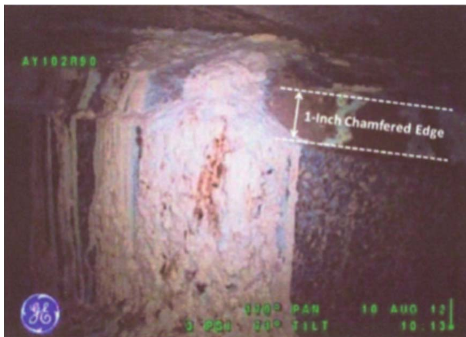
Leaked Waste in Secondary Containment of Tank AY-102

The Board advised DOE that if it chooses to retrieve some of the liquid from the tank, the tank should be closely monitored for signs of increased leakage or blockage of air channels distributing cooling air to the tank bottom. The Board also advised DOE to consider developing an improved thermal model of the tank to aid in understanding the safety significance of any changes observed after removal of liquids.