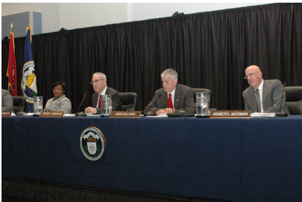
Y-12 Public Hearing in Knoxville, TN, December 2013