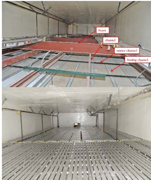
Figure 2: Condition of laboratory ceiling as evaluated (top) and current configuration (bottom).

Fire Suppression System In-Service Inspections —Facility engineers noted that significant portions of the fire suppression system had not been surveyed as part of required ISIs in cases where confined space permits were required for access. LANS procedures allow an exemption for inaccessible spaces, and these areas had been considered inaccessible. This included the service chase above the first floor corridors that allows access to much of the piping above laboratory ceilings. Considering how much of the critical piping is located in these areas, LANL should reevaluate its implementation of these procedures to provide more complete ISI coverage in the future. In subsequent discussions, the facility fire protection engineer said that future ISI procedures will include viewing piping accessible from the service chase. The staff review team believes this is a positive development at PF-4.